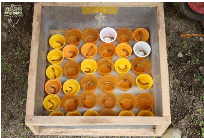
Meal-beetle larvae before pupating