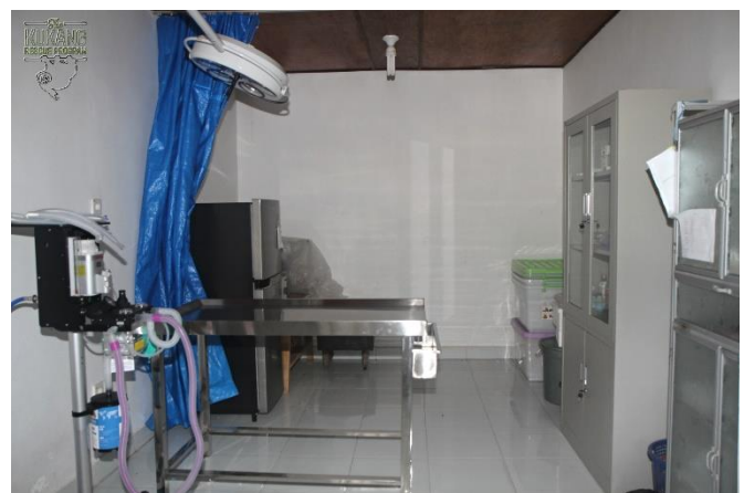
Equipped clinic of the rescue and rehabilitation centre

Further adjustments and improvements were made in the centre. One of the improvements was construction of a "biodiversity-drainage" pond which serves as a secure environment for wildlife and plants. It aims to contribute to increasing biodiversity of the entire rescue and rehabilitation centre that covers an area of approximately 2.5 hectares. In addition to safe water access, providing shelter, food, and breeding space for local fauna, the pond also helps to retain water from its soaked surroundings. This "biodiversity-drainage" pond was built in front of the office in the quarantine part of the centre. Beyond the pond and around the clinic were also built draining gutters that drain water into other pools on the grounds. In addition to the pond construction, other activities that contribute to increasing biodiversity of the whole area have been systematically carried out since