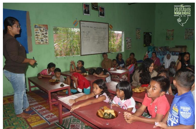
Handover of school reports and awarding best students