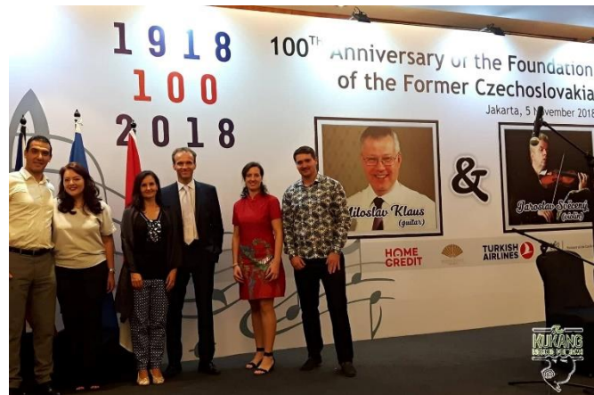
Celebrations of the 100 th anniversary of the foundation of the former Czechoslovakia