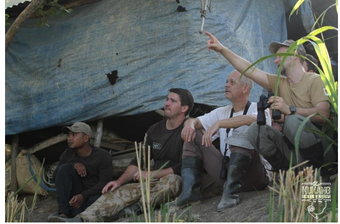
The visit from partner zoological gardens