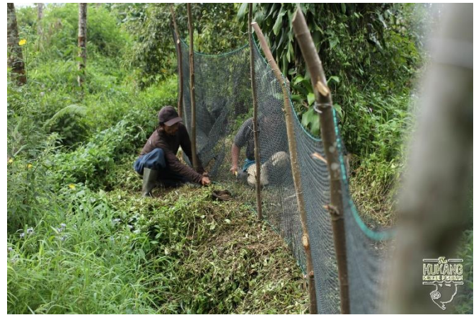
Fencing of the rescue and rehabilitation centre