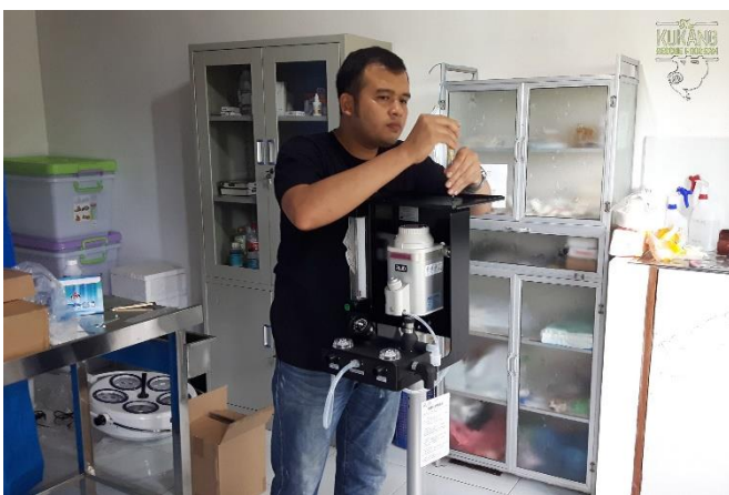
Installation of a new inhalation anaesthesia

The clinic of the rescue and rehabilitation centre was equipped with an inhalation anaesthesia, for which a collection under a crowdfunding campaign was organized in 2017. The clinic was equipped with a new special cabinet and other small equipment as well.