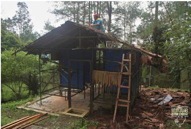
Replacement of the leaf roof of the quarantine for slow lorises