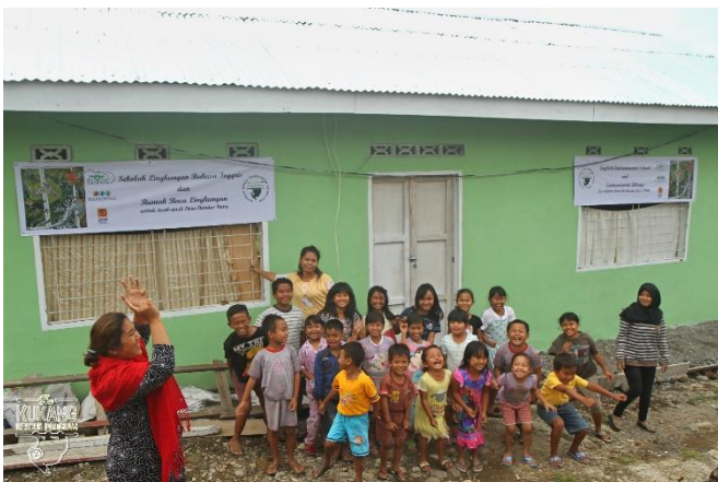
Greetings from children from the English-Environmental School