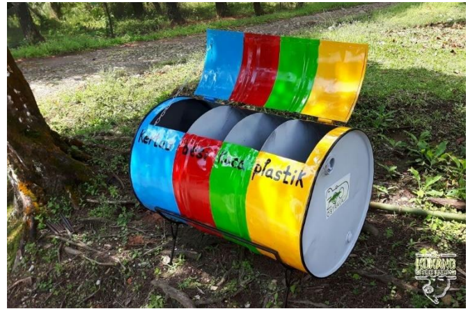
A bin for sorted waste