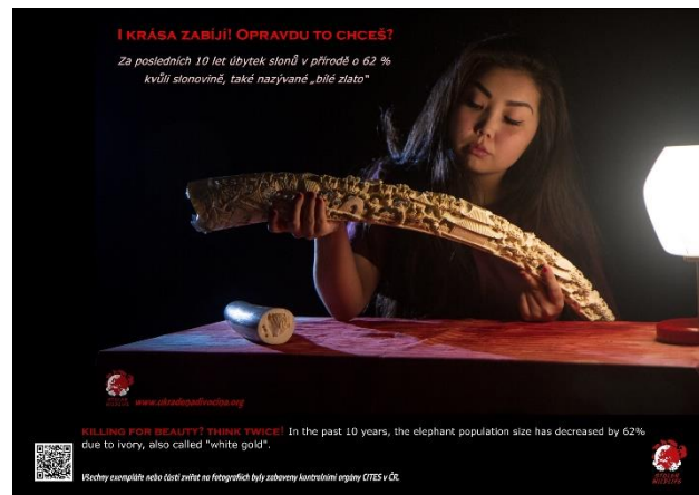
Stolen Wildlife, bloodless version – ivory

The press conference held on June 26 th in the Ostrava Zoo during the official launch of the campaign was attended by several journalists from the Czech Television, Czech Press Agency, Český rozhlas, MS Deník and Právo. The following media response was also significant when several reportages were broadcasted on the Czech Television: