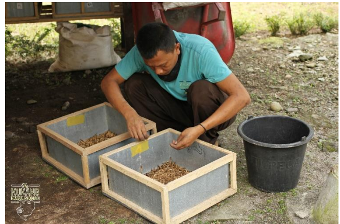
Collection of fortnight insect production