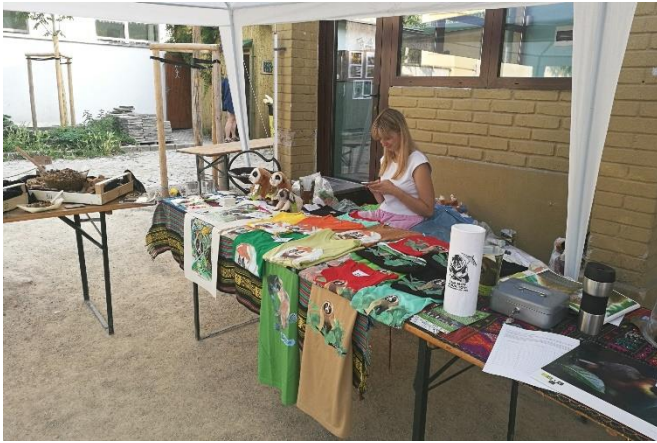
Kukang stall at the benefit event Sumatra in Danger