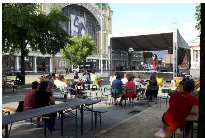
A lecture at the benefit event Sumatra in Danger