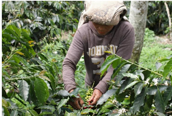
Coffee production in the village of Kuta Male

In order to find funding for implementation of our activities to support education and development of local communities we applied for a grant of the Czech Ministry of Foreign Affairs, the so-called "Small Local Development Assistance Project". The grant application is called "Support of Three Communities in Northern Sumatra through Environmental Education, Sustainable Coffee Production and Endangered Species Conservation" and its implementation will take place in the most part of 2019.