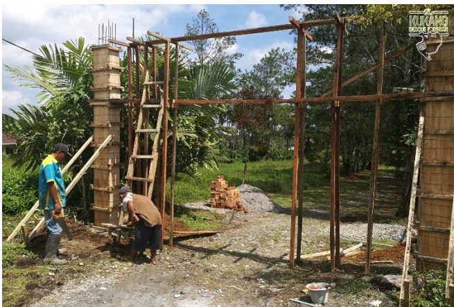
Foundations of the entrance gate

In 2018 the rescue and rehabilitation centre of the program was extended by several new buildings. A new entrance gate was built, a small building for guards and the whole rescue centre were fenced with a 1.5 m high net in order to get better protected. In the quarantine section of the rescue centre a new gate was built which closed this area and it will not be open to the public. A new, bigger store for material and equipment was built. Reconstruction works on the damaged parts of the centre, repair of the damaged fence, replacement of the leaf roof of the quarantine for slow lorises and protection of the insect farm against rain were carried out.