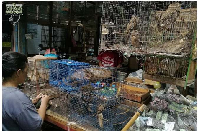
Animal market in Jatinegara, Jakarta