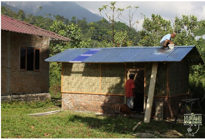
Building for storing of material