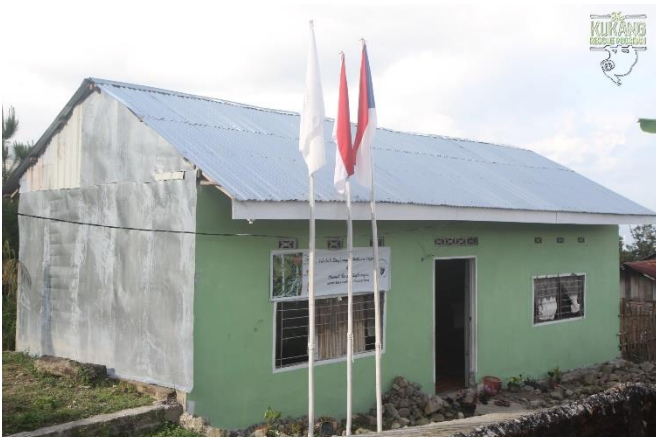
A new building of the English-Environmental School

Classes at the English-Environmental School were moved to a building that was constructed for this purpose. This school is for free for children living near the rescue and rehabilitation centre. Children attend the afternoon school three times a week, they learn English twice a week and they have environmental lessons once a week. At the end of each semester, the pupils receive their school reports and the best students are awarded. This special event is always attended not only by the students themselves, but also by their parents, all the teachers and the management of our Indonesian foundation (from now on the PASAL Foundation only).