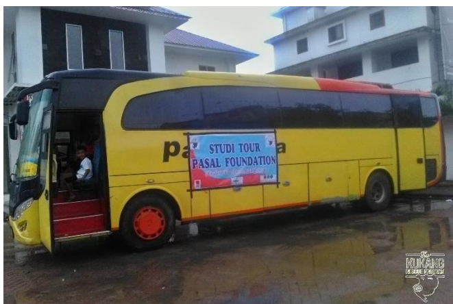
The bus for the school trip to the Siantar Zoo