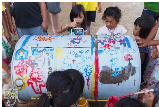
Decorating of bins for sorted waste

The Kukang Rescue Program plans to expand its activities by a project promoting production of environmentally friendly "Kukang coffee". Its distribution will support farmers from local community and protection of local