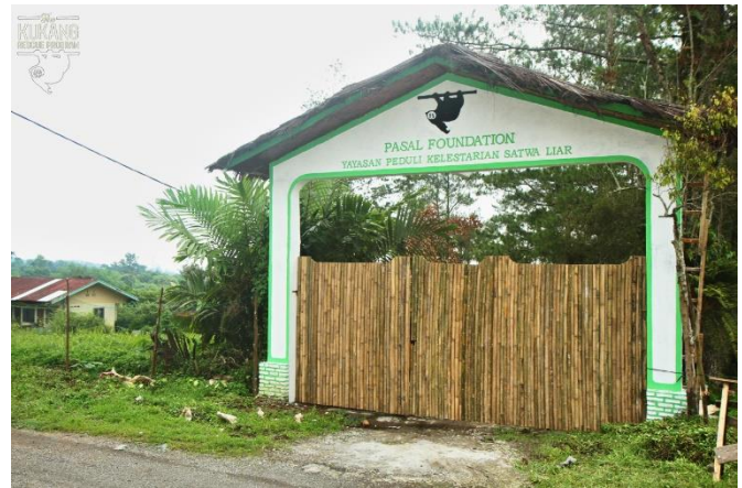
Newly built entrance gate