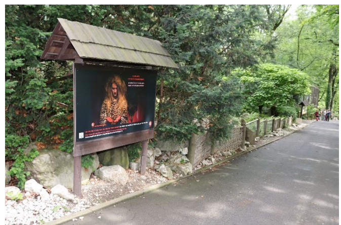
One of the panels of Stolen Wildlife Exhibition