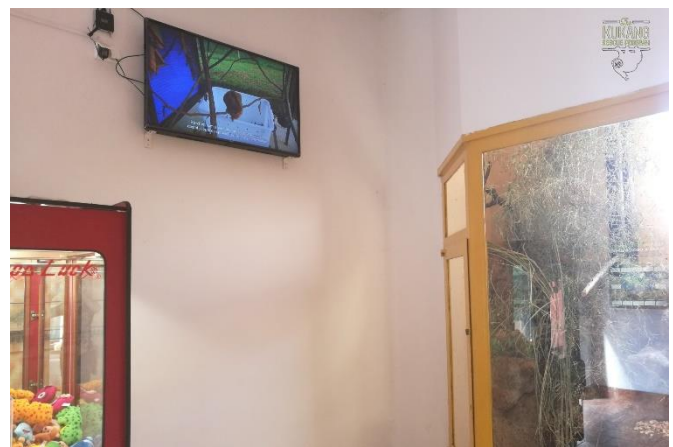
Video about The Kukang Rescue Program in Olomouc Zoo

Students and photographers at the Secondary School of Clothing and Services in Vizovice ( www.souviz.cz ) chose our plush slow loris as a class mascot, named it Vladimir and created an Instagram page for it. This plush mascot propagates an idea of the I Am Not Your Toy! campaign at the school and among families and those who are close to the students. The idea is that the plush slow loris serves for cuddling, but the living one certainly does not. A preview of Vladimir's Instagram page can be found here .