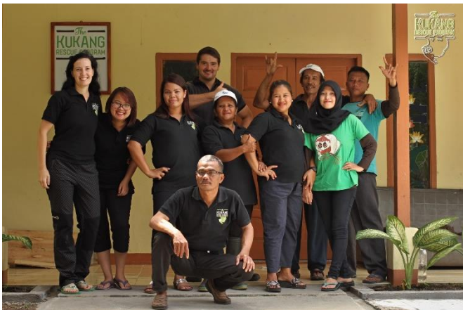
Indonesian Kukang team in the rescue centre

As every year so far, we succeeded in taking on new members to our Kukang team, either in Sumatra or in Europe. The Indonesian team is doing a very good job and is supported by the work of a great big team, mostly from the Czech Republic, but also from other European countries. One of the main objectives of The Kukang Rescue Program is to build an Indonesian team that will conduct most of the conservation activities associated with slow lorises and other animals. In the attached photos you can see the Indonesian Kukang team in 2018.