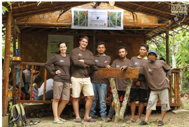
Indonesian field Kukang team

The Indonesian PASAL Foundation provides employment contracts for Indonesian employees, including social and health insurance. The Indonesian part of the Kukang team used these services in 2018.