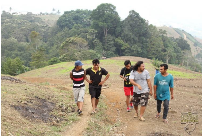
The visit of SwaraOwa in the community of Kuta Male

endangered animal species at the same time. We cooperate with an Indonesian foundation SwaraOwa on methodology of coffee production, distribution and protection measures. SwaraOwa has been running a Coffee and Primate Conservation Project on the island of Java for several years. In 2018, our team visited SwaraOwa's base in Yogyakarta where its coffee-processing and coffee-roasting plant is located. On the other hand, the team of SwaraOwa visited our community in Kuta Male where we plan to implement activities of this project. In addition to supporting the local community, the aim of these activities is to protect all fauna (a ban on animal hunting, except for wild boars, promoted by the village) in the Kuta Male area and to secure the area before the pilot release of rehabilitated slow lorises.