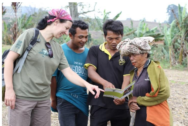
Anti-conflict team is handing out brochures to farmers

In 2018, a new Memorandum of Understanding (MoU) was signed between our Indonesian PASAL Foundation and the village of Kuta Male regarding a new project called "Kuta Male Waste Sorting and Reduction Project". The aim of the project is to reduce the pollution of the area adjacent to the Gunung Leuser Ecosystem protected area by setting up waste management in the village of Kuta Male (Karo regency). One of the main tasks of the project is to familiarize residents of all ages with basic principles of waste sorting and its further processing and to raise their awareness of pollution issues of the unique environment. This should, as a further step, contribute to protection of unique biodiversity of this area with critically endangered animals, such as the Sumatran orangutan, Sunda pangolin, greater slow loris, binturong, siamang, and others. The plan is that the Kuta Male waste will be bought, transported and recycled by Perkumpulan Arta Jaya organization. Our program has been cooperating with the community in Kuta Male for a long time, as we have built an environmental library for children in this village and we consider this area to be suitable for releasing rehabilitated slow lorises. This new project was financially supported by the Ostrava Zoo.