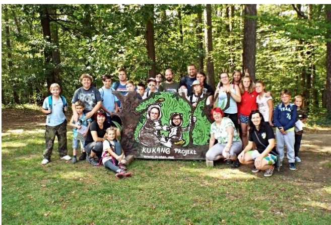
Day for Slow Lorises in Olomouc Zoo

In the Olomouc Zoo, new televisions were installed in several pavilions where videos on The Kukang Rescue Program are projected in a loop. The same videos are projected also in the Ostrava Zoo.