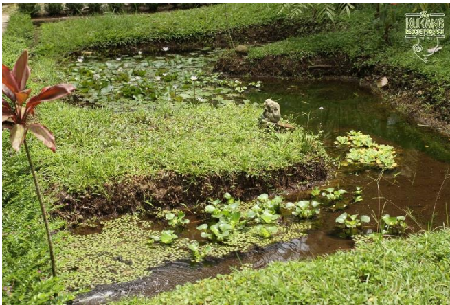
The drainage and biodiversity pond

A new waste reduction and sorting system was introduced in the centre and an insect hatchery was expanded and improved.