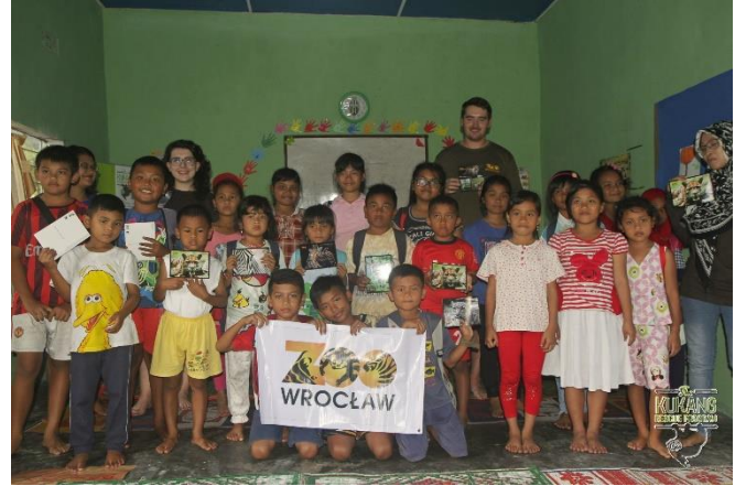
Pupils with animal pictures from the Wroclaw Zoo