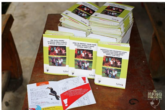
Printed brochures for farmers in three languages

Work of the anti-conflict team over the past years resulted in a publication entitled "How to Protect Your Farm against Animals while Letting Them Live" (more information on the brochure can be found in the press release here ). Last year, 150 brochures were printed and distributed to dozens of selected farmers living near forests in several selected areas. Thanks to many useful tips, the brochures should help farmers to protect their farms from wildlife and to minimize crop damage without having to kill these animals. The brochures together with Kukang colouring books were also handed out to farmers' children, as there is an educational section on biology of selected animal species and on protection of endangered species living near farms.