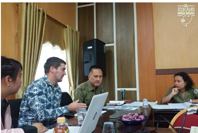
Talks on protection cooperation with government agency