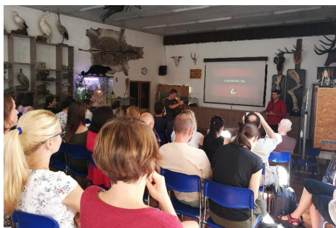
A lecture on Stolen Wildlife for CITES officers