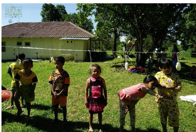
Children celebrate the Independence Day in the rescue centre

In Sumatra, there was a lecture on illegal trade in animals, pets, protection of slow lorises and The Kukang Rescue Program for new pupils from the above-mentioned English-Environmental School. Also, a lecture on protection of pangolins and slow lorises was organized for children at the Medan International School ( www.mismedan.org ). Other educational and awareness-raising activities for local children continued during the year 2018.