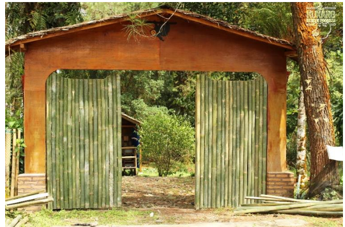
New gate of the quarantine section

The clinic of the rescue and rehabilitation centre was equipped with an inhalation anaesthesia, for which a collection under a crowdfunding campaign was organized in 2017. The clinic was equipped with a new special cabinet and other small equipment as well.