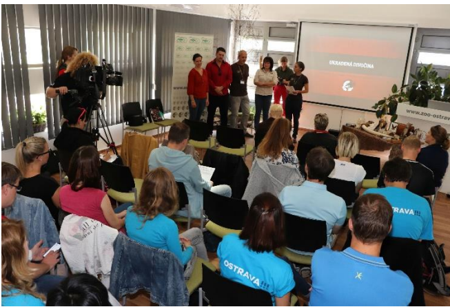
Press conference at the official launch of the campaign

Another important media output was a reference to the Stolen Wildlife campaign in the World Association of Zoos and Aquariums' (WAZA) flash news and also on the WAZA Facebook pages .