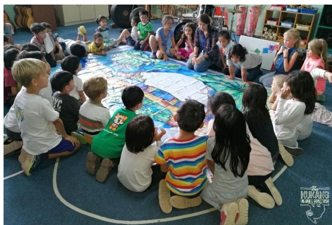
A lesson in the International School in Medan

In December, the management of The Kukang Rescue Program spent a couple of days in Thailand on the Phuket Island in order to document offering of slow lorises to tourists for taking photos with them. The Phuket Island should be one of the places where these illegal practices occur most often. A monitoring on daily basis was carried out on the places known on the internet for the possibility to find Thai people with slow lorises there (beaches of Patong, Karon, Kata, the streets and the centre of Patong, surroundings of the Kata beach, etc.). On the Karon beach the team managed to find a Thai woman who was offering a slow loris for taking photos with it. Several outputs following the survey will be published in 2019 and works with the acquired material will continue further.