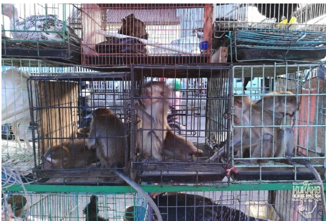
Long-tailed macaques and other mammals on animal market

In 2018, the team of The Kukang Rescue Program also conducted a survey of animal markets in Jakarta, Java and in Medan, Sumatra. On these markets, many species of mammals and other animals and also many bird species can be seen. However, this survey confirmed again that nowadays, slow lorises (but also other endangered animal species) can be only rarely discovered on street markets and the business has moved to the internet where there is less risk of uncovering the traders.