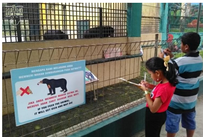
Education of the pupils in the Siantar Zoo

Every year on August 17 th Indonesia celebrates the Independence Day. The Kukang Rescue Program takes part in the celebrations and supports this day in various ways every year. In 2018 the children from our English-Environmental School celebrated the day together with their teachers who prepared fun activities during which the children engaged in nature conservation as well.